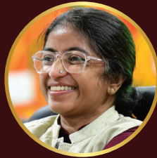
Smt. Sunitha Krishnan

Director General - Vigilance & Enforcement, E.O Pri. Secretary to Govt, General Admin (V&E) Dept, (HFAC) Director, Telangana Cyber Security Bureau, (i/c) Director, TG FSL - Hyderabad